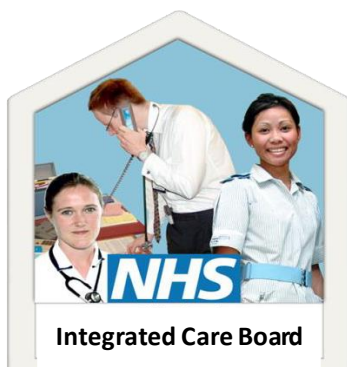
Integrated Care Board

Most local health services including GPs, dentists, opticians, pharmacies, hospital care, NHS 111 and out of hours services are commissioned by local integrated care boards (ICBs).